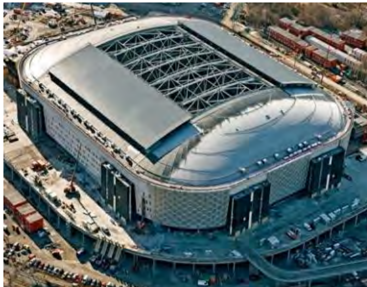
Figure 2. Swedbank Stadium