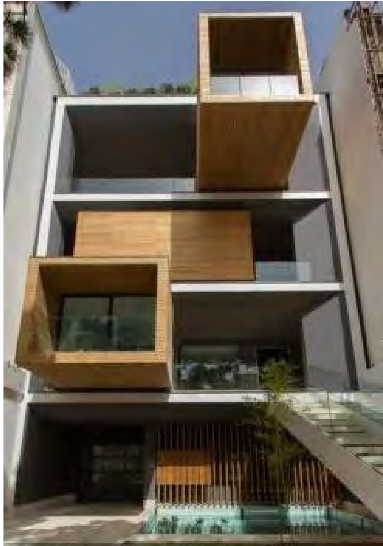
Figure 3. Sharifi-ha House