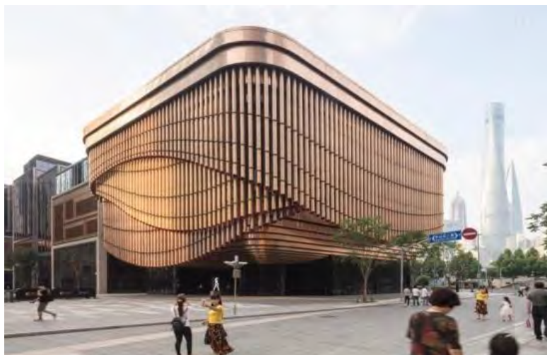
Figure 7. Shanghai theater