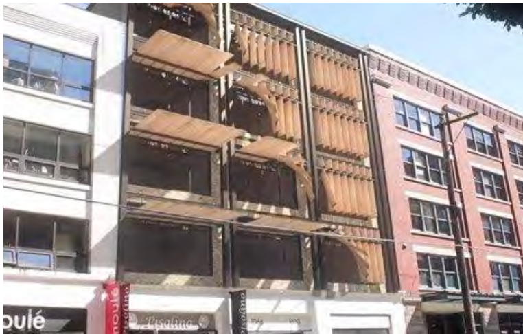
Figure 6. Penumbra