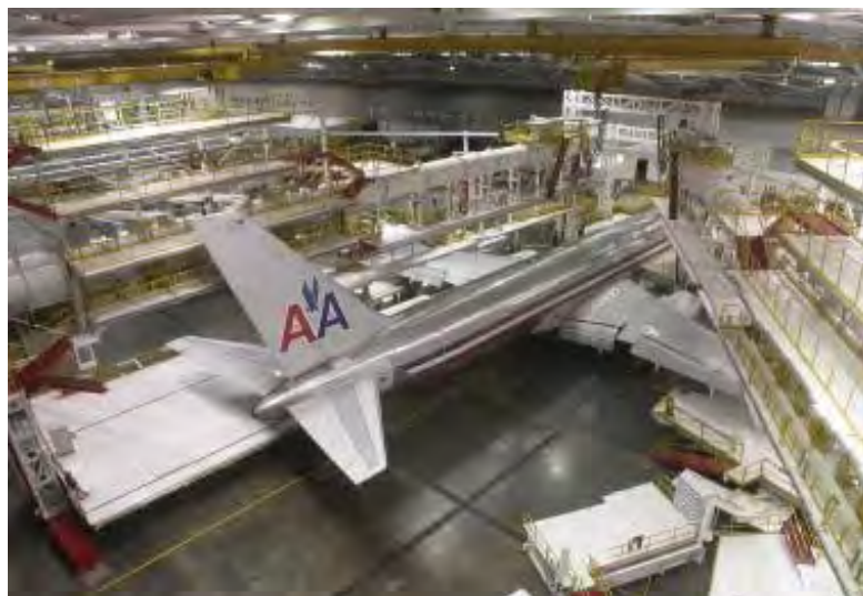
Figure 4. American Airlines by Uni-Dock