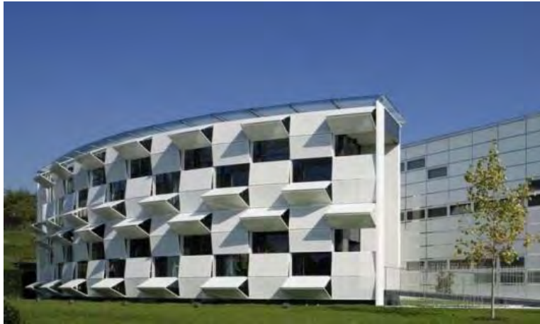
Figure 5. The dynamic solar shading of Kiefer Technic Showroom