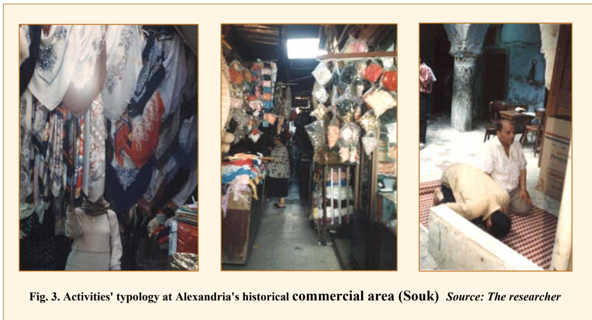
Fig. 3. Activities' typology at Alexandria's historical commercial area (Souk)