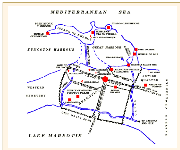
Fig. 2. Alexandria's original planning features. Source: [11].

Alexandria (named after its founder) lies on a stretch of land in the midst of the Mediterranean Sea, lake Mareotis, and the nearby island 'Pharos'. It was founded there in order to serve as a regional capital. The location was ideal for it was intermediate between Greece, across the Mediterranean, and the rest of Egypt. Its original plan was practical like most ancient Greek cities. It consisted of an orthogonal street pattern, with the sea being the main landscaping element. The Heptastadion was built to connect the Island of Pharos with Alexandria. Initially, it was merely a narrow structure, but later silted and formed the land area known today as the Mansheya neighborhood.[10]