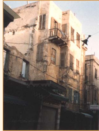
Fig. 4. Physical characteristics of Alexandria's historical commercial area (Souk)