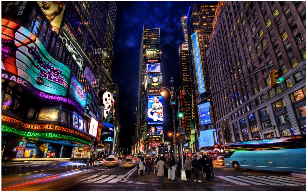
(Fig. 2) Liveability of Time Square among other disnyfication and adaptive reuse practices

In the 1980s, a long-term development plan was proposed to “clean up” the area, increasing security, pressuring undesirables to relocate, and opening more tourist-friendly attractions and upscale establishments was done. Detractors have countered that the changes have homogenized or “Disneyfied” the character of The Square as in (Fig. 2). In 1992, the Times Square Alliance dedicated to improving the quality of commerce and cleanliness in the district. Times Square boasts attractions such as Studios, elaborate stores across the street from each other, as well as restaurants and along with a number of multiplex movie theaters. It has also attracted a number of large financial, publishing, and media firms to set up headquarters in the area.