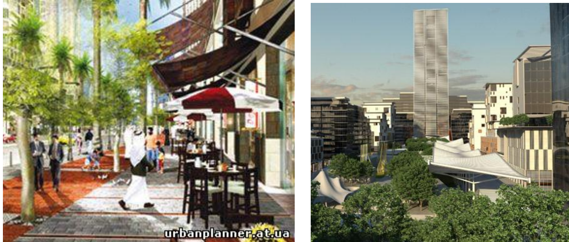
(Fig. 6) The new development of Al-Ruwais by JDURC

The proposed project by JDURC will develop the built environment, public open spaces, as well as the infrastructure, to turn the unsafe deteriorated settlement into a safe and a modern planned district.