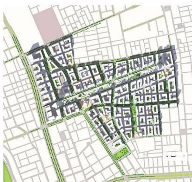
(Fig. 5b) The planned Al-Ruwais by JDURC