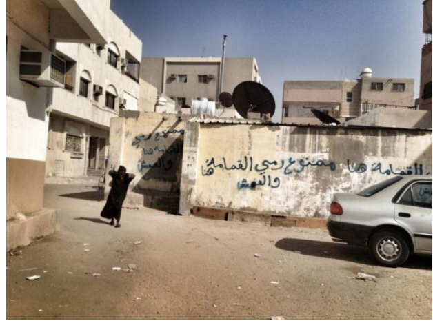
(Fig. 4b) Decay and unsafely in Al-Ruwais

“The regeneration project is an integrated development that will transform an unplanned settlement into a modern and fully serviced urban environment.”, as per JDURC According to a study of Al-Ruwais Development Project, Al-Ruwais population is made up of 32 percent Saudis, 39 percent non-Saudi Arab speaking nationals, 15 percent Asians, and 14 percent from other nationalities.