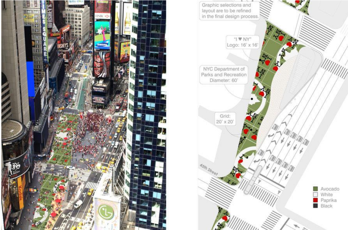
(Fig. 3) Designing for safety and security to protect visitors from adjacent traffic