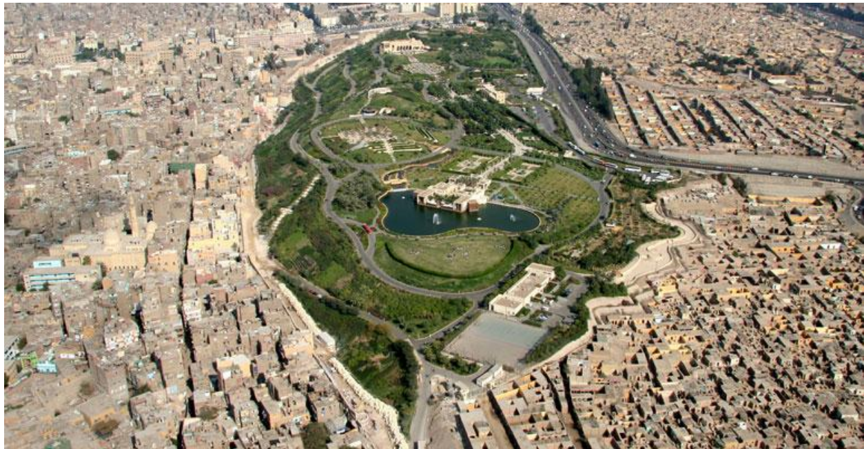
(Fig. 7) The Aga Khan Trust for Culture project of Darb Al Ahmar

wall. Three landmark buildings, from the 13 th and 14 th Century have been restored. Public spaces such as, Aslam square were restored. Local housing has been renovated and returned to their owners. A housing credit scheme is aiding private individuals in the rehabilitation of their own houses. The construction of the park and the restoration of cultural monuments are meant to be catalysts for social and economic development and the overall improvement of the quality of life in the district. See (Fig. 7)