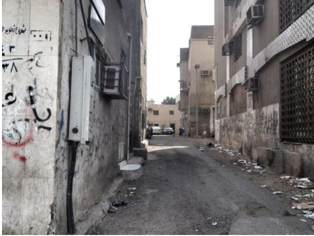
(Fig. 4a) Al-Ruwais underdeveloped settlement