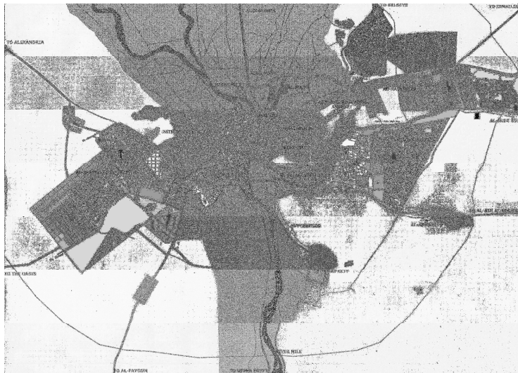
Figure (3): Urban agglomeration of Cairo.