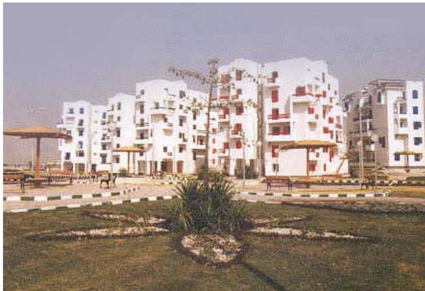
FIGURE 2: Mubarak Youth Housing Project

The first phase had been started in May 1998 and was completed after two years. The units of this phase were replicated in 15 new cities in Egypt. The units were allocated according to objective criteria and through official investigations to ensure the eligibility of each beneficiary. This project has received the Council of Arab Ministers for Housing and Reconstruction AWARD in the year 2000 for its innovative approach that integrates architectural, planning, social, economic, cultural, technological, and environmental dimensions.