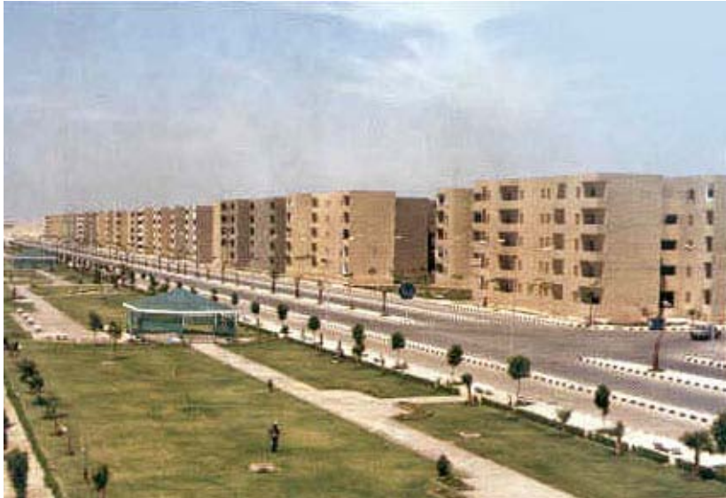
FIGURE 3: Future Housing Project

projects, which practice cross subsidies, land sharing schemes and utilization of local building materials. Experimental projects with new standards for subdivision and building materials with semi-serviced and non-serviced plots can also be initiated. Such experiments can facilitate the learning process for up scaling.