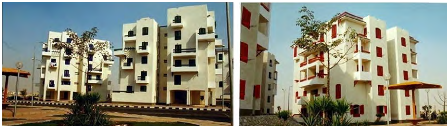
Figure 4 The national project of social housing (the youth housing project).