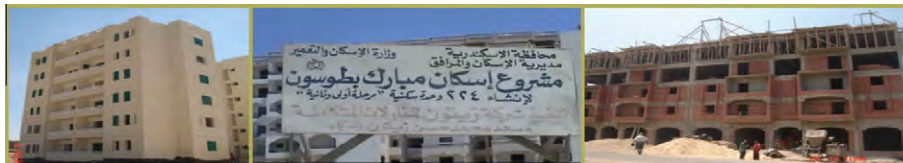
Figure 3 Type of social housing provided by private sector.