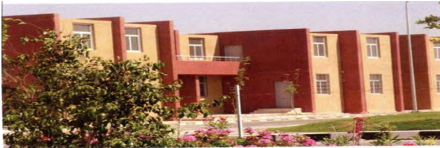
Figure 2 Beit Al Eila project (family home project) typical design.